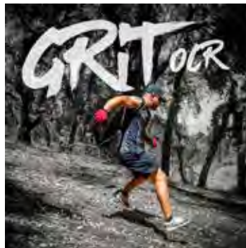
Grit OCR Obstacle Course Race GritOCR.com