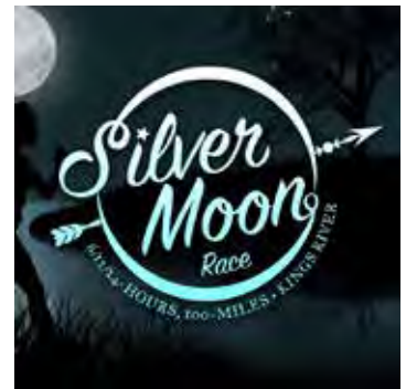
Silver Moon Race 6/12/24-Hours/100-Miles SilverMoonRace.com