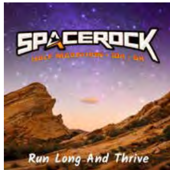
SPACEROCK Trail Race Half Marathon/10K/5K SPACEROCKTrailRace.com